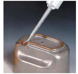
Aremco-Bond™ 568 bonds copper tube heater to reservoir.